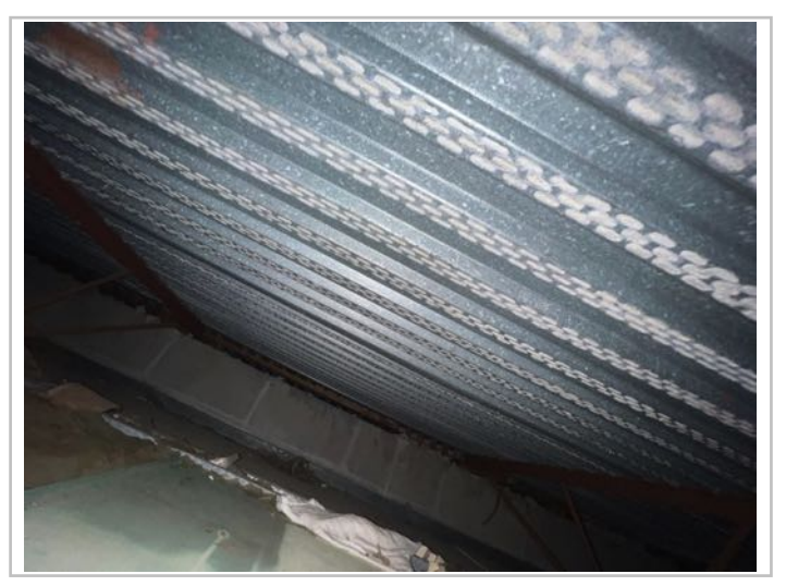
corrugated concrete deck form